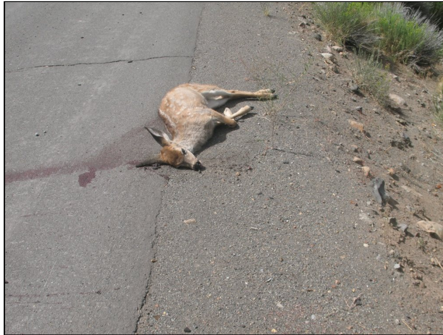
Fawn hit by car on Glenshire Drive